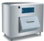
Bin: BH Series